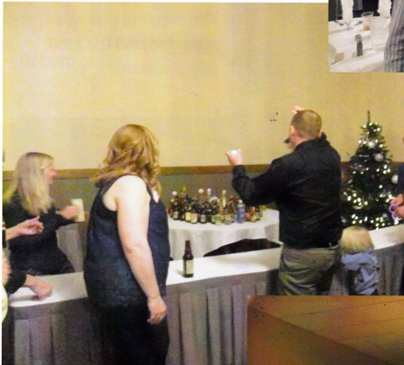
The wine toss was very popular and there was more than wine on the table.