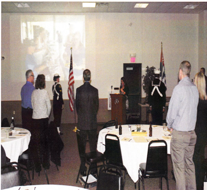
The Flag Presentation

Swearing in of the new Commander for 2018