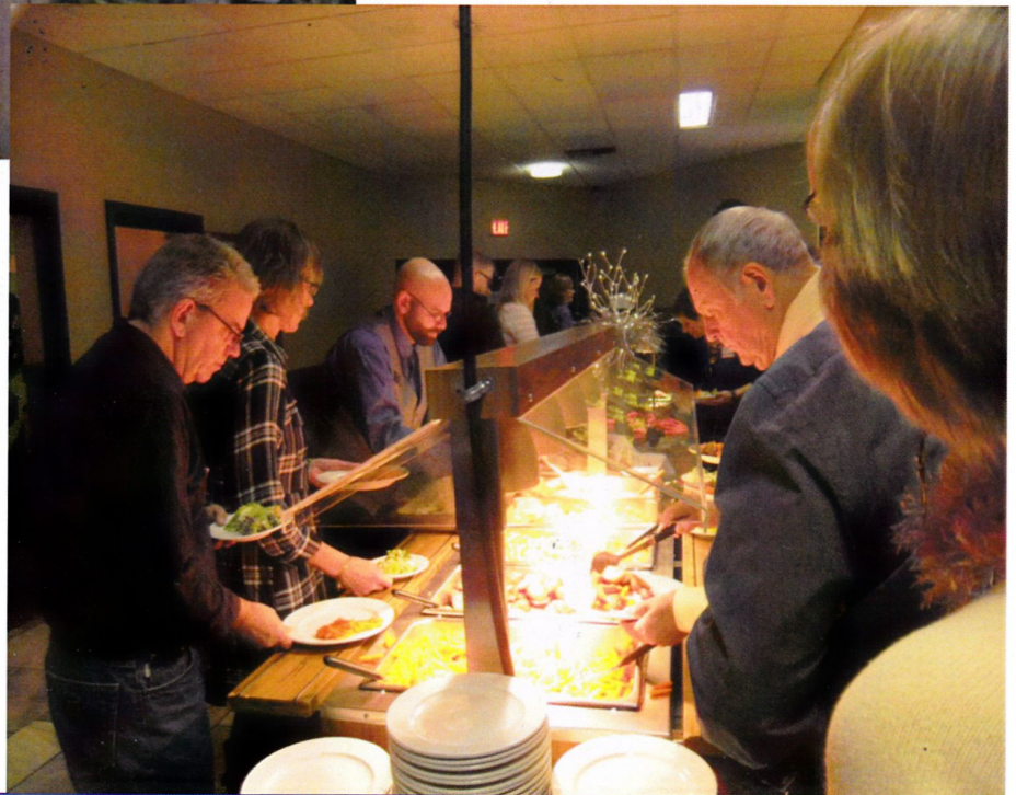
The food again was excel- lent at Barkers Island.